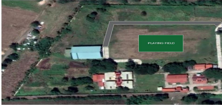
DSWD Field Office 02, #3 Dalin na Pagayaya, Regional Government Center, Canga Sur, Tuguegarao City, Cagayan, Philippines (3500) Website: http://www.dswd.gov.ph Tel No. : (078) 304-0696 Telefax: _____